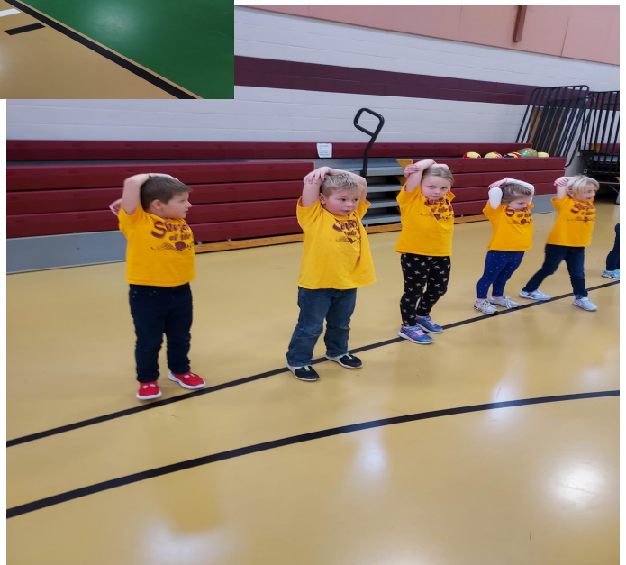
First graders in gym with the kindergarten.